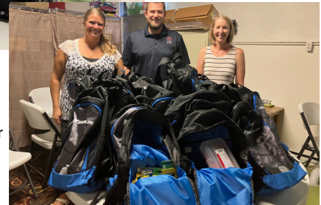
Kindergarten backpacks from Modern Heating & Air