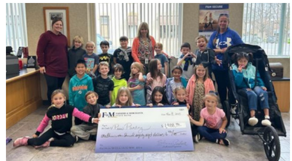
2nd grade class counting Paw Pantry donations at F&M bank

In addition to the above needs served by CRISP, we also made over 228 referrals to over 24 different agencies, community organizations, and churches. We assisted clients in applying for Medicaid, SSI/SSDI, and SNAP benefits. We provided budgeting materials and services to families. We provided 13 families with a "Birthday in a Bag." One of the most important services CRISP provides is that first step in matching families to the right resources based on their current needs and unique situation.