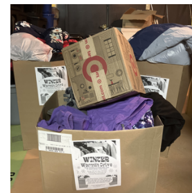
WCSD: Winter Warmth Drive

We received many donations of new and gently used winter gear, which is greatly appreciated. CRISP takes donations of these items year round.