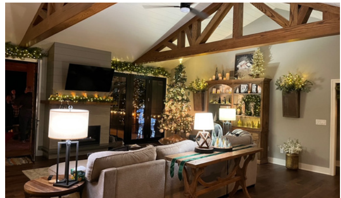
Holiday Tour of Homes Pictures