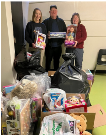
Toys for Tots Optimist Club