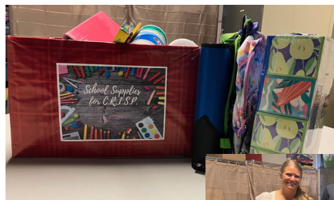
Flourish Chiropractic School Supply Drive

Thank you to the many caring citizens and businesses who made monetary donations for the purchase of school supplies!